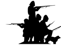
The Redcoats Society